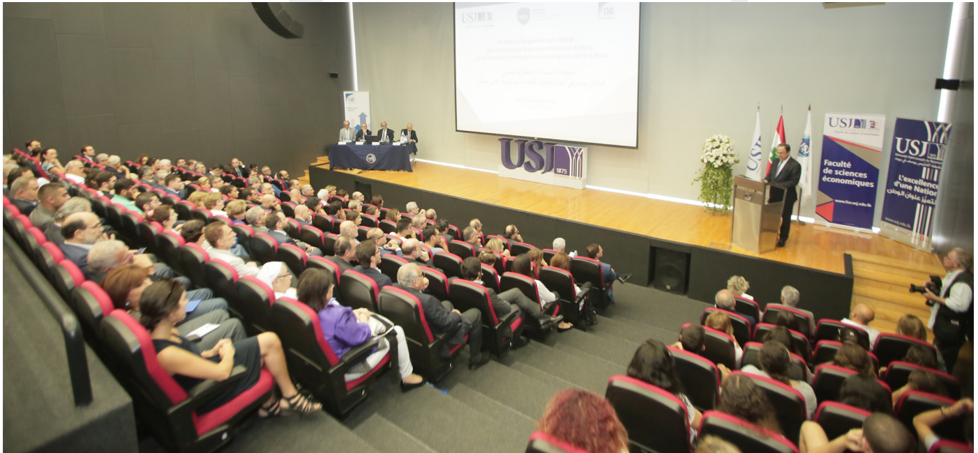
The conference hosted around 250 attendees including officials, economists, professors, students and those involved in economic affairs.