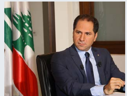
H.E. MP Samy Gemayel