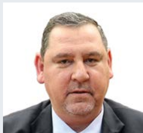
H.E. Senator Ernesto Javier Zaccarías Irún