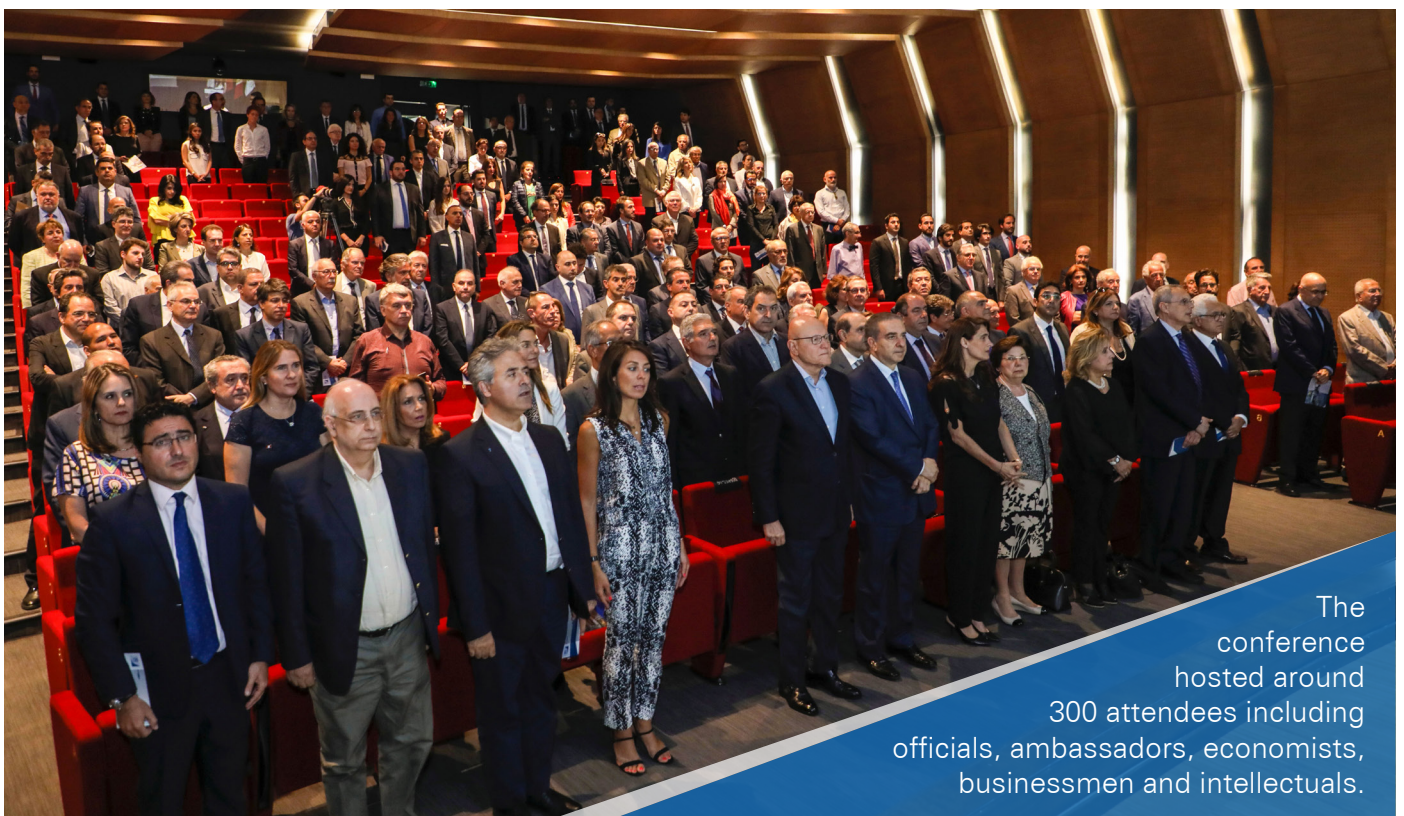
The conference hosted around 300 attendees including officials, ambassadors, economists, businessmen and intellectuals.