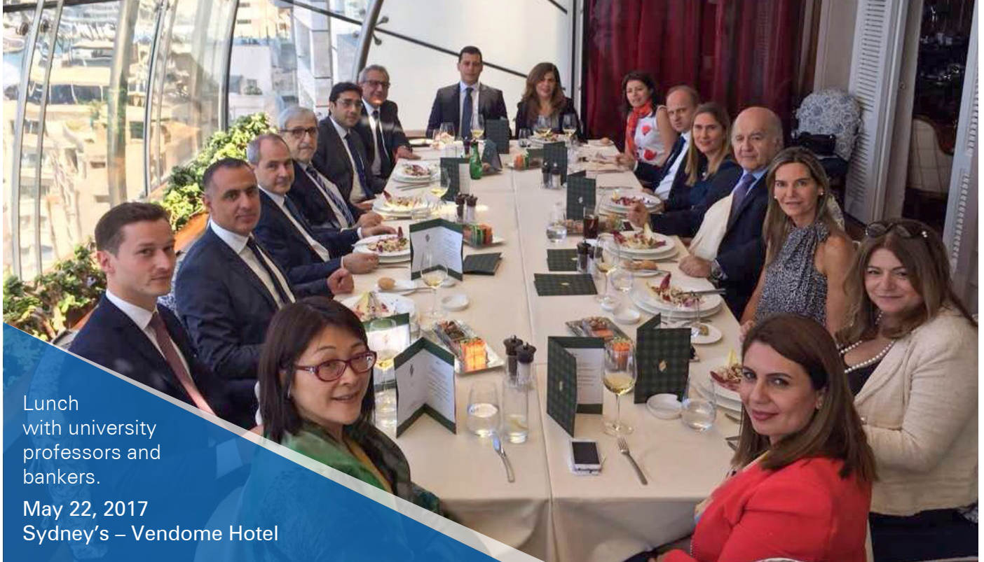
Lunch with university professors and bankers.