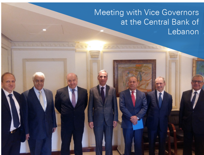
Meeting with Vice Governors at the Central Bank of Lebanon