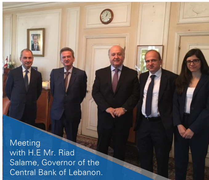
Meeting with H.E Mr. Riad Salame, Governor of the Central Bank of Lebanon.