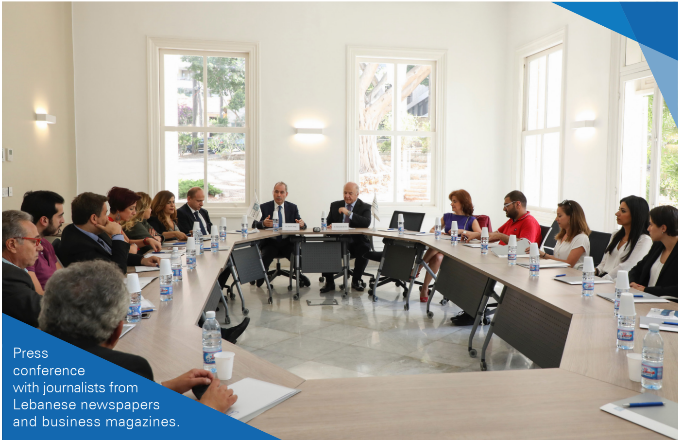
Press conference with journalists from Lebanese newspapers and business magazines.