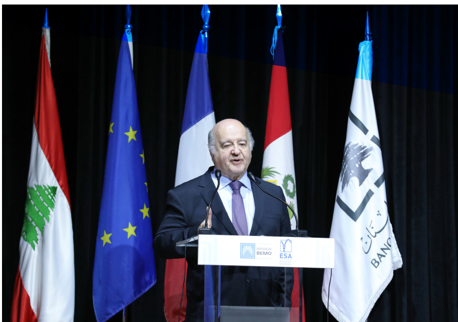
H.E. Mr. Hernando De Soto giving a speech about the power of property rights in creating prosperity

H.E. Mr. Hernando De Soto is a renowned international economist, president of the Institute for Liberty and Democracy (ILD) based in Peru and author of the best seller "The Mystery of Capital".